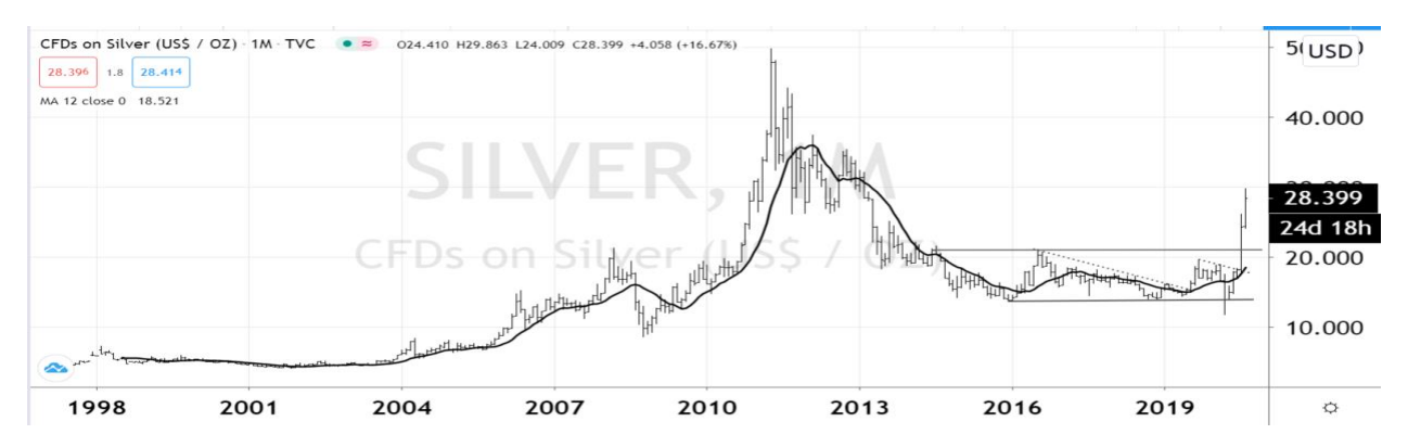
Commodity cycles tend to continue for years

Just like in forex, trends in commodities tend to last for multiple years. Note that in the last bull cycle, the uptrend in gold and silver continued for ten years (2001 - 2011). At that time, gold prices rose 800% and silver soared 1,200%. Today, gold and silver have doubled from their recent lows. Gold and silver are likely in the early part of multi-year moves. The breakout in silver is only three weeks old.